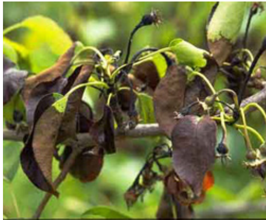
#10 Fireblight on Pear