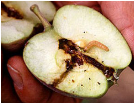
#5 Codling Moth Damage