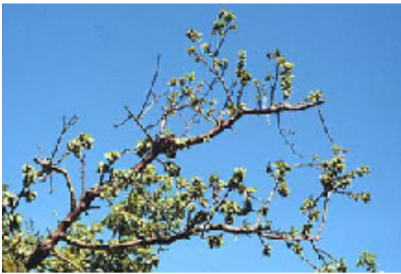
#3 Eutypa Dieback on Apricot pruned in winter