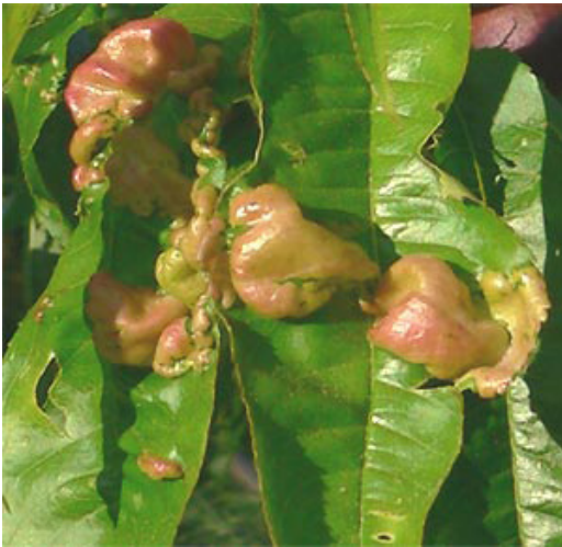
#4 and #8 Peach Leaf Curl