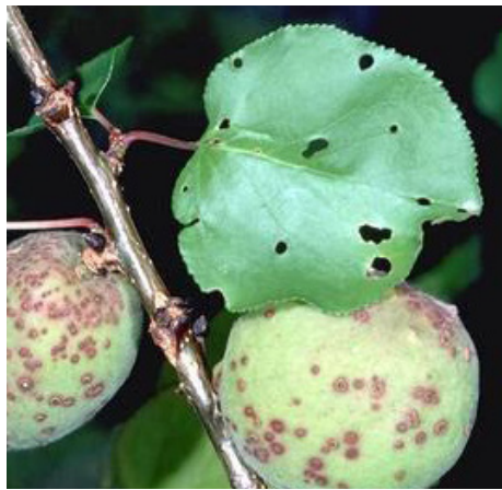
#9 Shot Hole Fungus