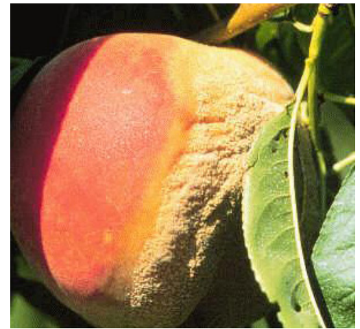
#14 Brown Rot